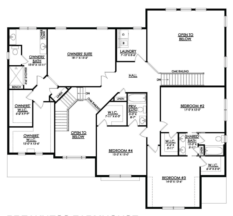
PREAKNESS FARMHOUSE 2ND FLOOR PLAN