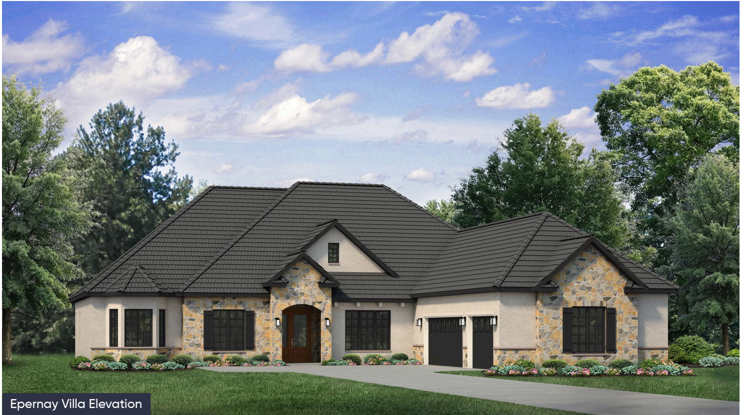
Epernay Villa Elevation

**PRICING IS FOR HOME ONLY. HOMESITE TO BE PURCHASED SEPARATELY AT AN ADDITIONAL COST** Discover the Epernay Villa, a stunning open-concept single-story home that seamlessly blends classic elegance with modern design. Upon entering, you'll be greeted by a warm and inviting Foyer with hardwood floors and tray ceilings, which continue throughout the main living areas. The Dining Room is perfect for formal dinners and features large windows that allow for ample natural light. Across the hall is a private Study, offering a quiet space for reflection or remote work. The Kitchen is a chef's dream, with 48-inch tall cabinets, granite countertops, and Thermador stainless steel appliances. The large island is the perfect spot for casual dining or entertaining, and the attached Morning Room is ba ... Read More at tuskeshomes.com