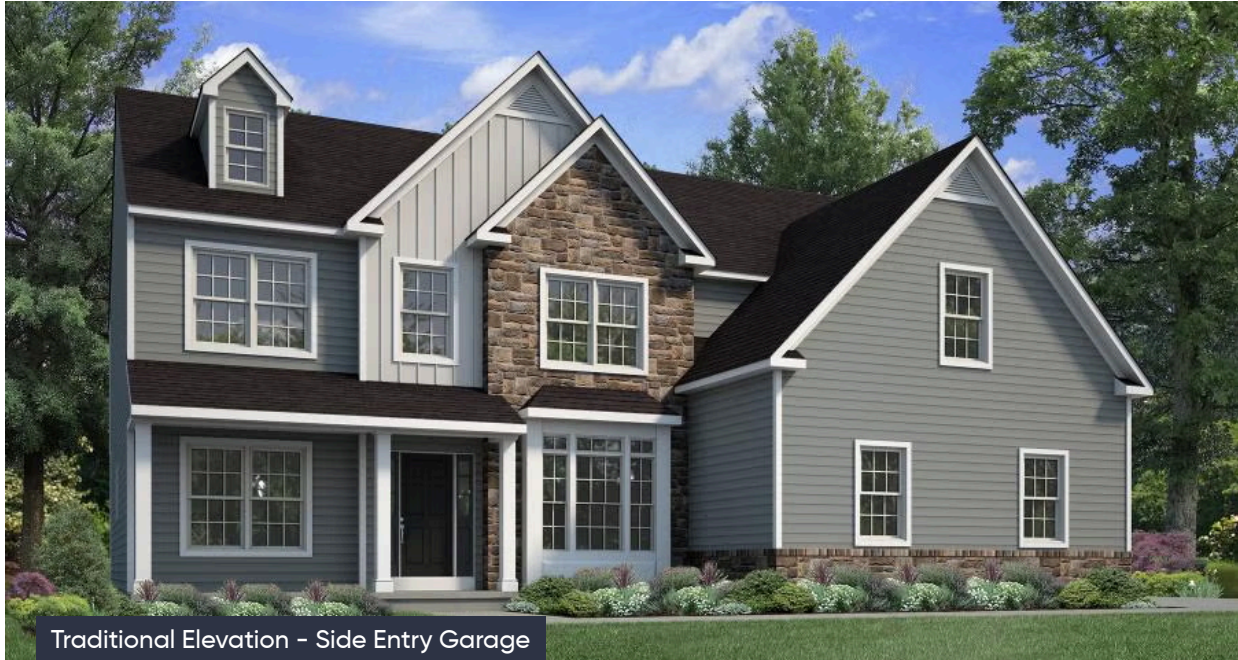
Traditional Elevation - Side Entry Garage

In The Enclave at Bushkill from $829,900