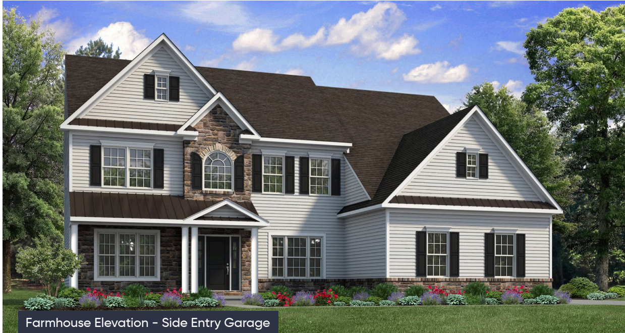
Farmhouse Elevation - Side Entry Garage

In The Enclave at Bushkill from $859,900