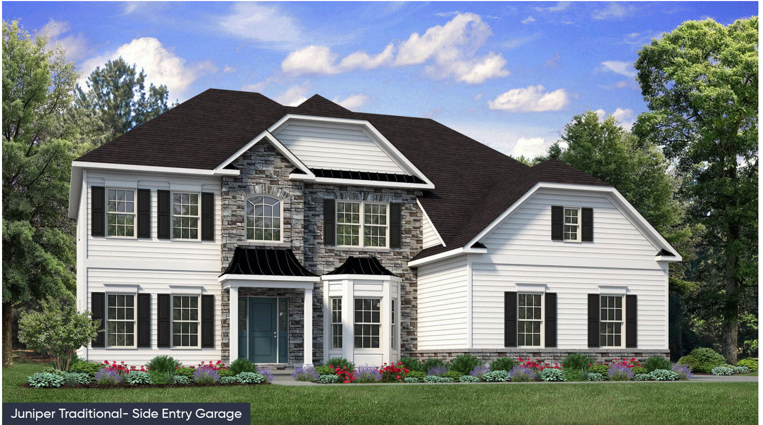
Juniper Traditional- Side Entry Garage

Elevate your lifestyle with the Juniper, offering the perfect balance of privacy and comfort for you and your family. An impressive two-story Foyer sets the tone for this home's spacious open-concept main living area. The Kitchen is a cook's dream, with an expanded island, a walk-in pantry, and a butler's pantry for serving drinks or snacks. The airy 2-story Great Room boasts a gas fireplace and plenty of windows for natural light. A private Study and Powder Room complete the 1st floor layout. Head up the open staircase to find an enormous Owner's Suite with sitting area, a walk-in closets, and private Owner's Bath. Additionally, a Guest Suite with its own Bath, two additional Bedrooms that share a Jack-n-Jill bath, and a convenient 2nd floor laundry room can also be found on the 2nd ... Read More at tuskeshomes.com