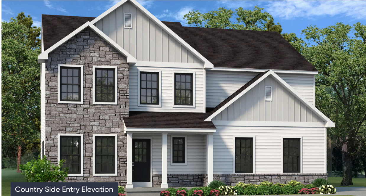
Country Side Entry Elevation

In The Enclave at Bushkill from $749,900