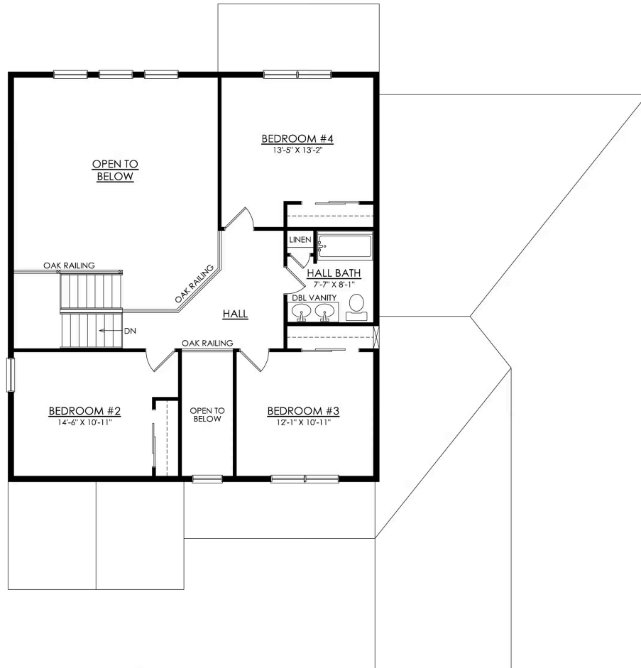
SIENNA COUNTRY 2ND FLOOR PLAN HERITAGE

In The Enclave at Bushkill from $799,900