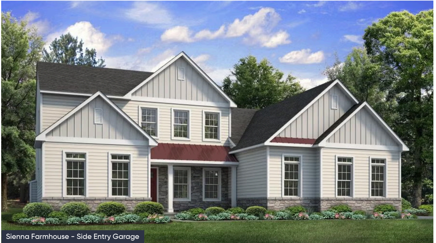
Sienna Farmhouse - Side Entry Garage

Live in luxury and style with the spacious Sienna, featuring an open-concept open living space that's designed for entertaining. The Kitchen boasts generous countertop space and a spacious island. Dine in elegance in the formal Dining Room or cozy Nook. The 2-story Great Room features a relaxing fireplace, making it the perfect spot to unwind or host family and friends. The private Study, separated by double doors, provides a quiet place to work or learn from home when needed. Step into the first-floor Owner's Suite, complete with a sitting area and a private bath retreat. On the second floor, there are three additional bedrooms and a shared hall bath for the family. For added flexibility, this plan also features an optional first-floor In-Law Suite, which relocates the Owner's suite upstairs. Read More at tuskeshomes.com