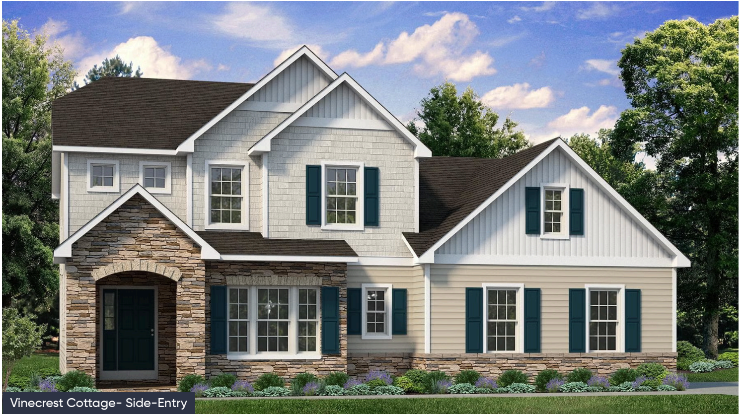
Vinecrest Cottage- Side-Entry

The Vinecrest floor plan features an open-concept layout, ideal for entertaining family and friends. The Kitchen includes an island with an overhang and a convenient walk-in pantry for your organizational needs. Connected to the kitchen is the Dining Room, as well as the spacious Great Room, which features a gas fireplace for cozy nights at home. The entire first floor is filled with natural light from the walls of windows, creating a beautiful and inviting space to call home. Upon entering this home through the Foyer, you'll find a private Study through elegant double French doors, a coat closet, and a Powder Room. Just off the Two-Car Garage is the spacious Laundry Room with plenty of room for organizing cleaning supplies or anything you'd prefer to keep out of sight. The large 1st-Floor O ... Read More at tuskeshomes.com