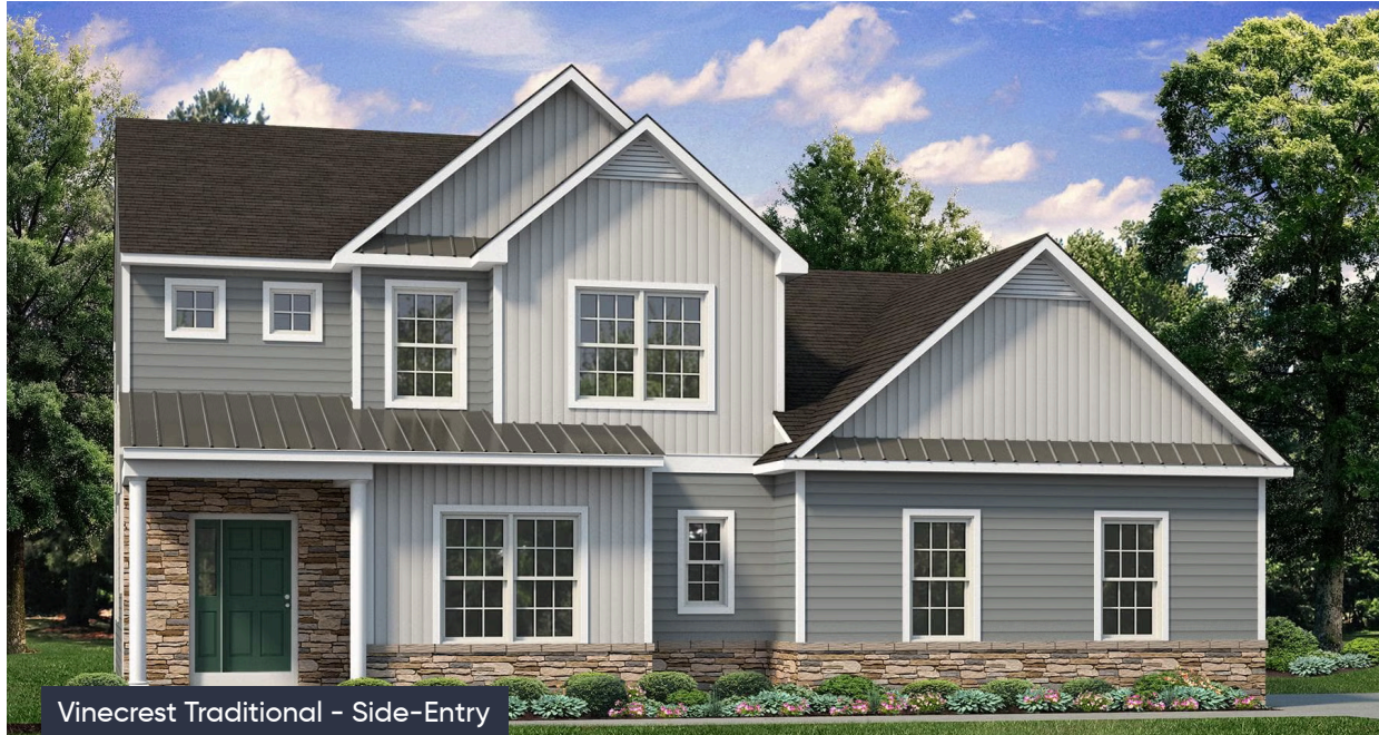
Vinecrest Traditional - Side-Entry

In The Enclave at Bushkill from $759,900