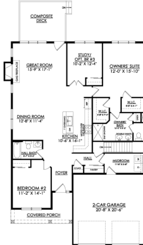
INGLEWOOD II STARTING AT 1700 SF