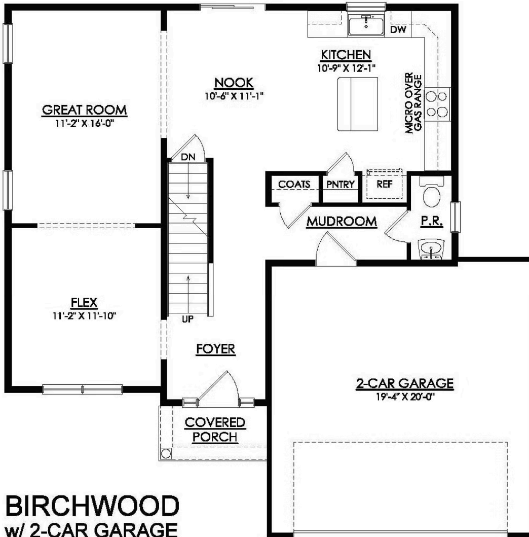
BIRCHWOOD w/ 2-CAR GARAGE 1ST FLOOR PLAN