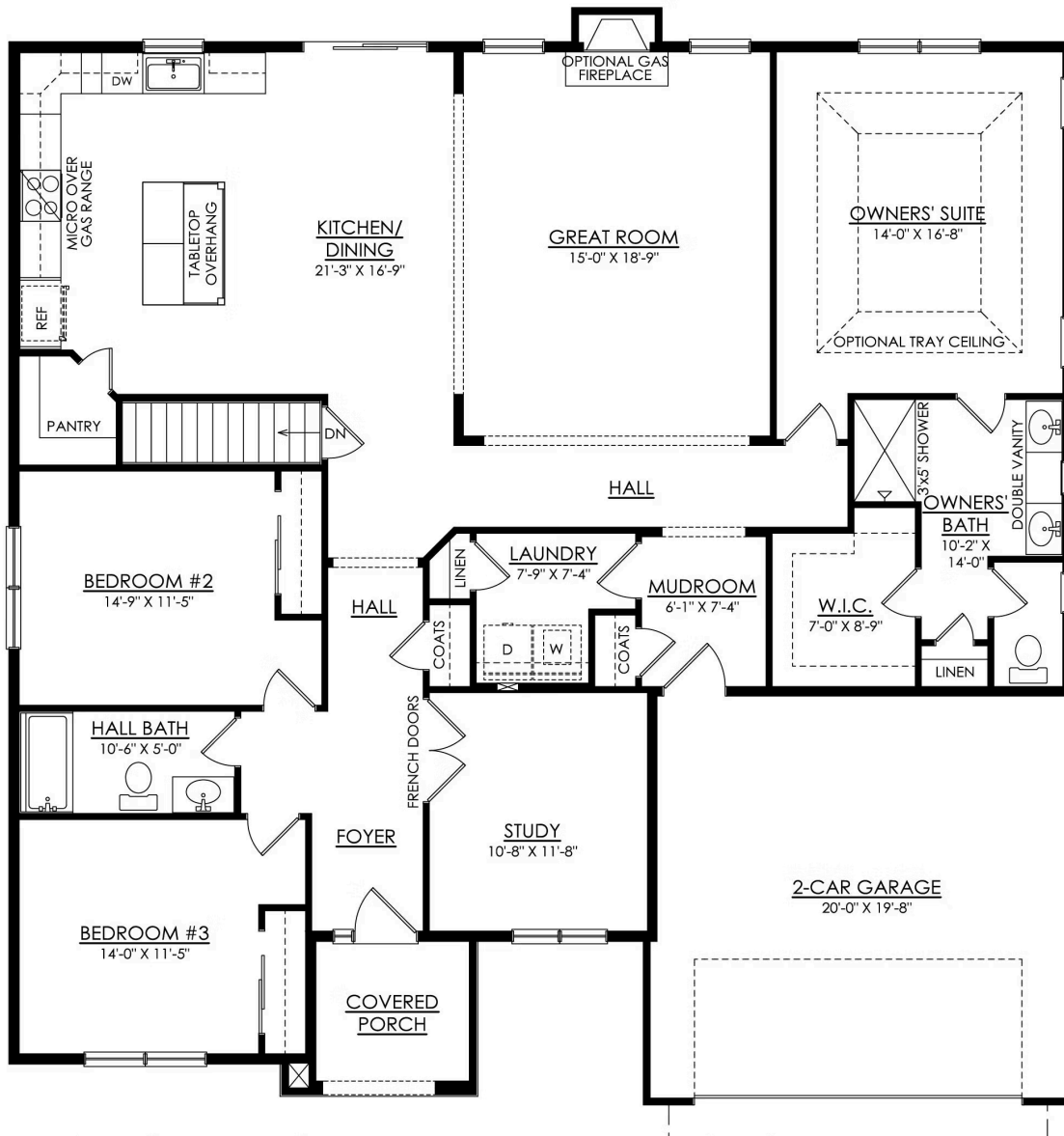
FOLINO COTTAGE 1ST FLOOR PLAN LIFESTYLE