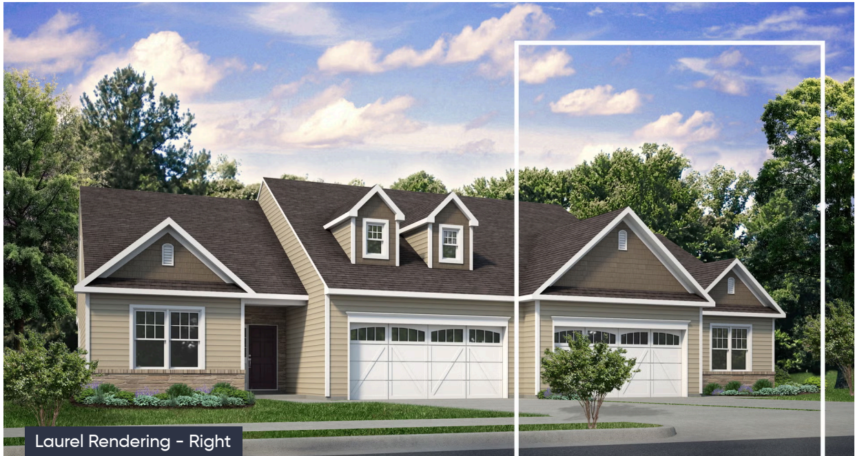
Laurel Rendering - Right