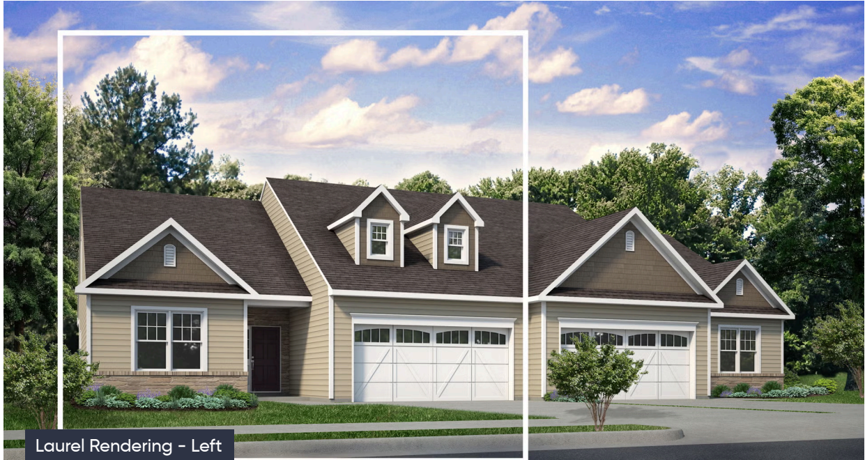
Laurel Rendering - Left