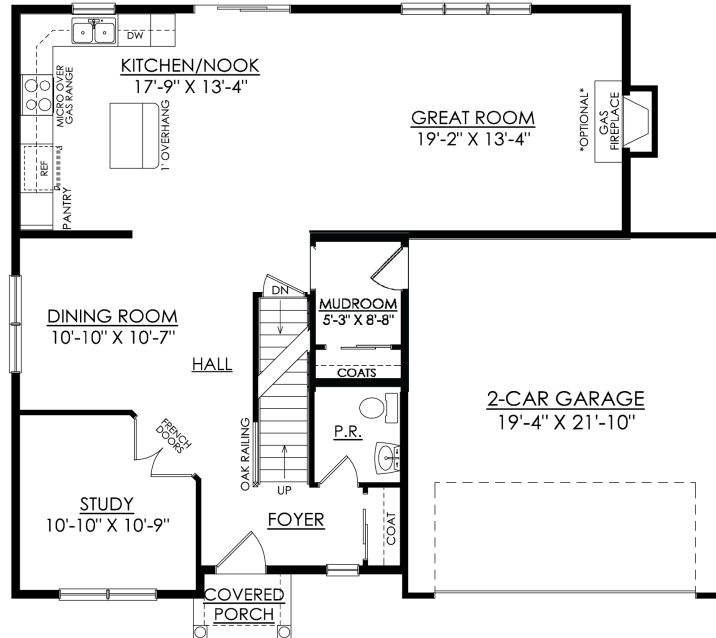
MADISON COUNTRY STARTING AT 2392 SF