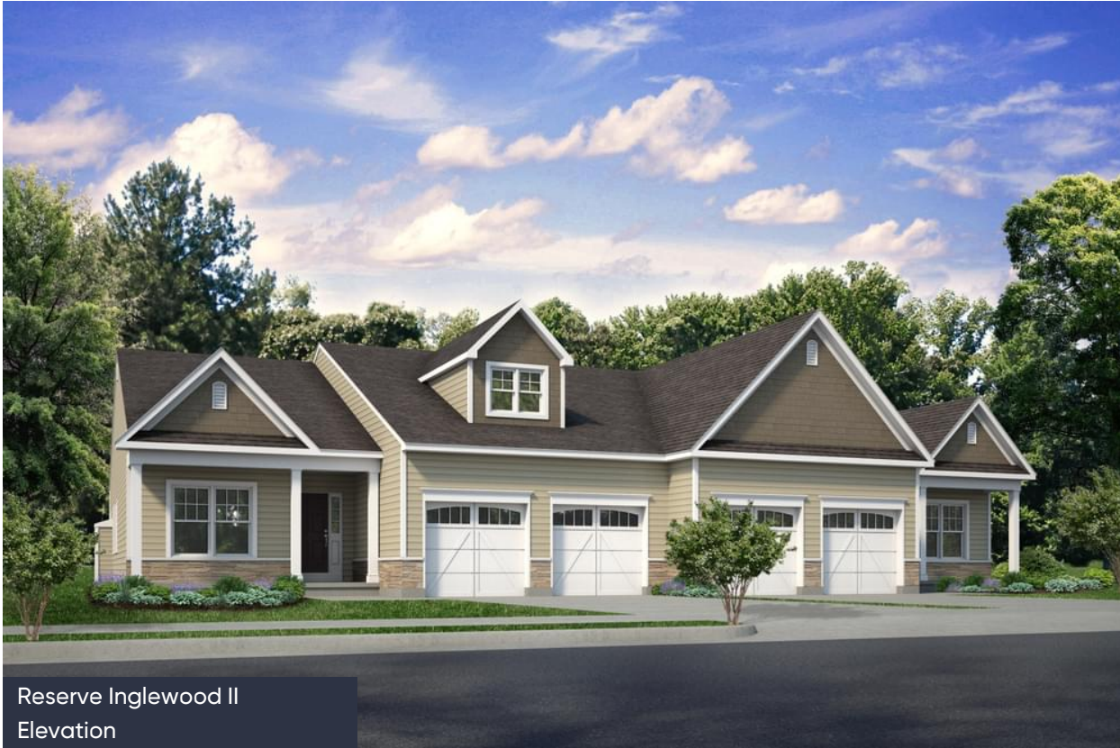
Reserve Inglewood II Elevation

The Reserve Inglewood II is a maintenance-free patio home design, found in our Sand Springs community. This smaller layout features an open-concept design that makes entertaining a thoroughly enjoyable experience. The Kitchen, Dining Nook, and Great Room are all open and connected to maintain a spacious feel to the home. The Kitchen features an island with an overhang ... Read More at tuskeshomes.com