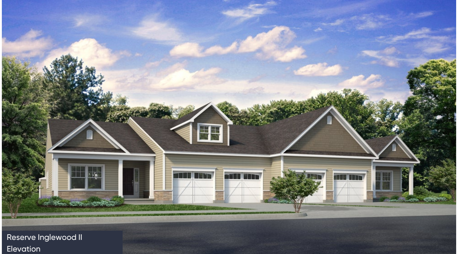
Reserve Inglewood II Elevation

The Reserve Inglewood II offers worry-free, single-story living with exterior maintenance such as Lawn Care, Landscaping, Snow Removal, Gutter Cleaning, Trash and more all included in the monthly HOA fee. Enter the open-concept floorplan and be wowed by the spacious and inviting atmosphere that is perfect for entertaining. The Kitchen is equipped with a large island, complete with an overhang for extra seating, Pantry, and adjacent Dining Room. The spacious Great Room includes a French door leading to a Trex Deck, providing an additional outdoor space for entertaining. From the 2-Car Garage, step into a combined Mudroom and Laundry room, and then continue to the coat closet for additional storage. The first-floor Owner's Suite is a true escape with two Walk-In Closets and a luxurious ... Read More at tuskeshomes.com