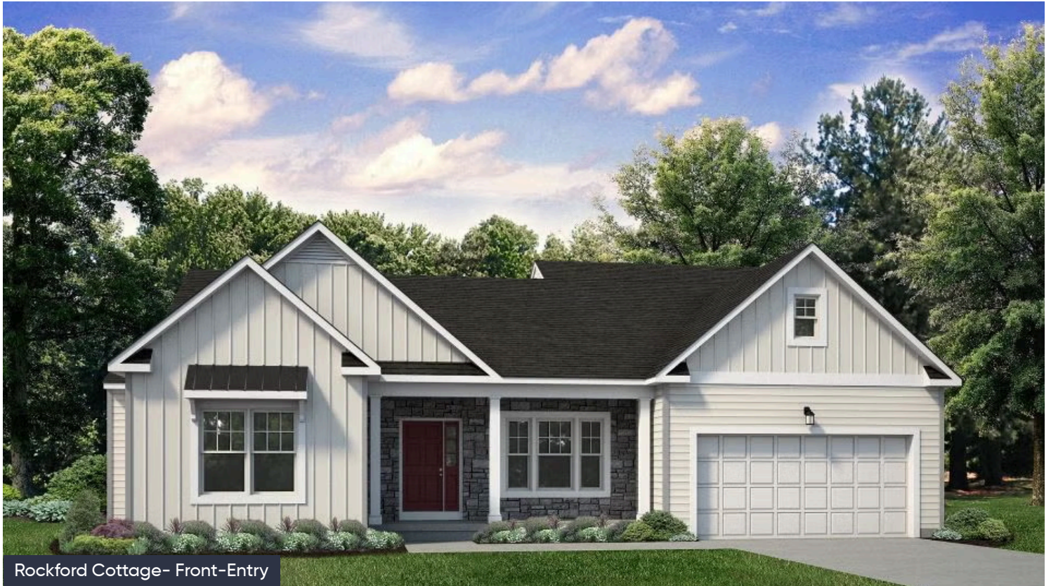
Rockford Cottage- Front-Entry

Introducing the Rockford, an inviting Ranch home designed for both comfort and style and offers a thoughtful layout that maximizes space and functionality. At the heart of the home, the open-concept design of the Great Room and Kitchen creates a welcoming atmosphere. With a grand cathedral ceiling and a wall of windows, there is a sense of openness so that no matter how many people visit, you will never feel cramped. The Owner's Suite tucked away in the back of the home includes two spacious Walk-In Closets, as well as its own ensuite bathroom for added privacy. The Rockford also features two additional Bedrooms that offer flexibility for guests, a home office, or other uses to suit your needs. With thoughtfully designed spaces and a layout that promotes flow and functionality, t ... Read More at tuskeshomes.com