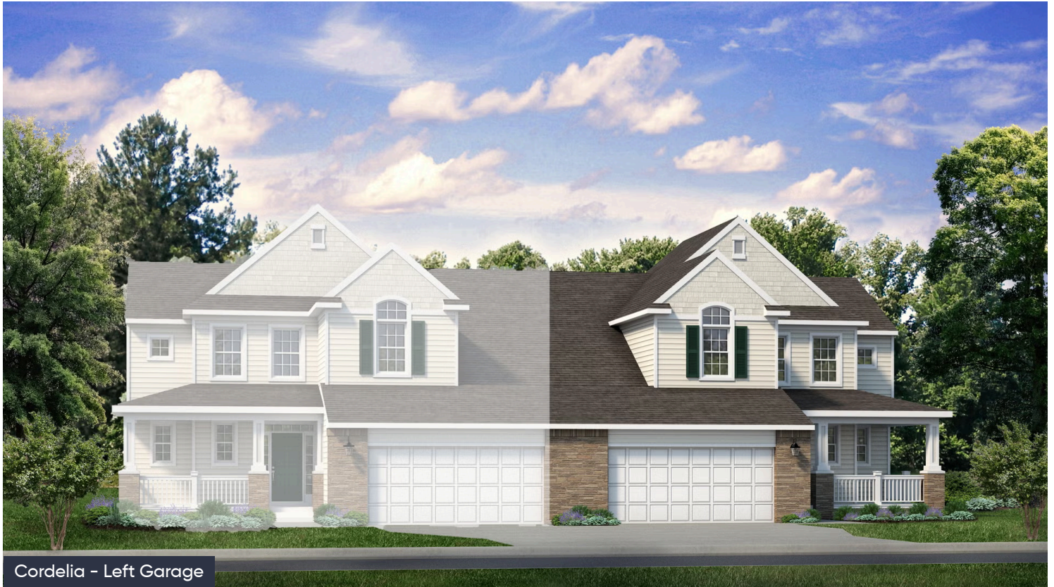
Cordelia - Left Garage

Discover the Cordelia, a 55+ Active Adult home design designed with your comfort in mind. Enter through the covered front porch into the cozy Foyer and enjoy the convenience of the first-floor Mudroom, Laundry Room, and Powder Room. The Great Room with vaulted ceilings, a wall of windows, and a gas fireplace is perfect for relaxing or entertaining. The kitchen, overlooking the Great Room, features a large island with room for seating and a Nook with a beautiful bay window that leads to your Trex deck. A formal Dining Room can also be found in the main living area, perfect for entertaining. Continue to the first-floor Owner's Suite retreat, offering two walk-in closets and a private Owner's Bath with two vanities and a fully tiled 4' x 6' shower. The second floor includes two additional Bedr ... Read More at tuskeshomes.com