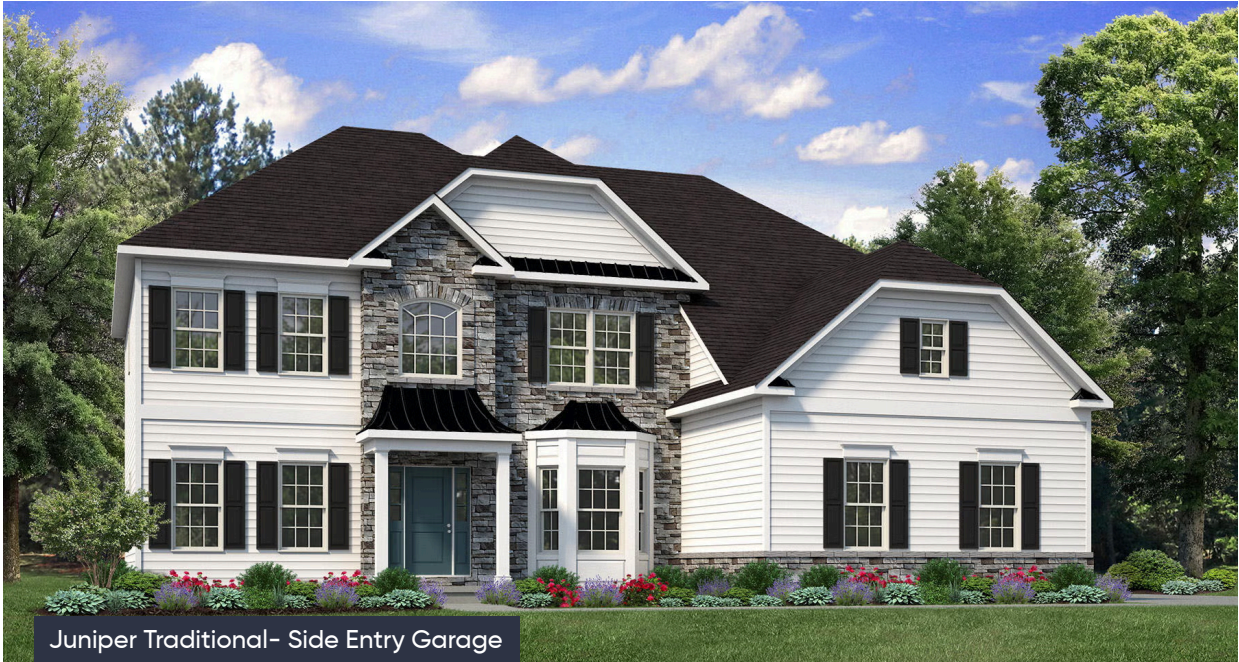
Juniper Traditional- Side Entry Garage