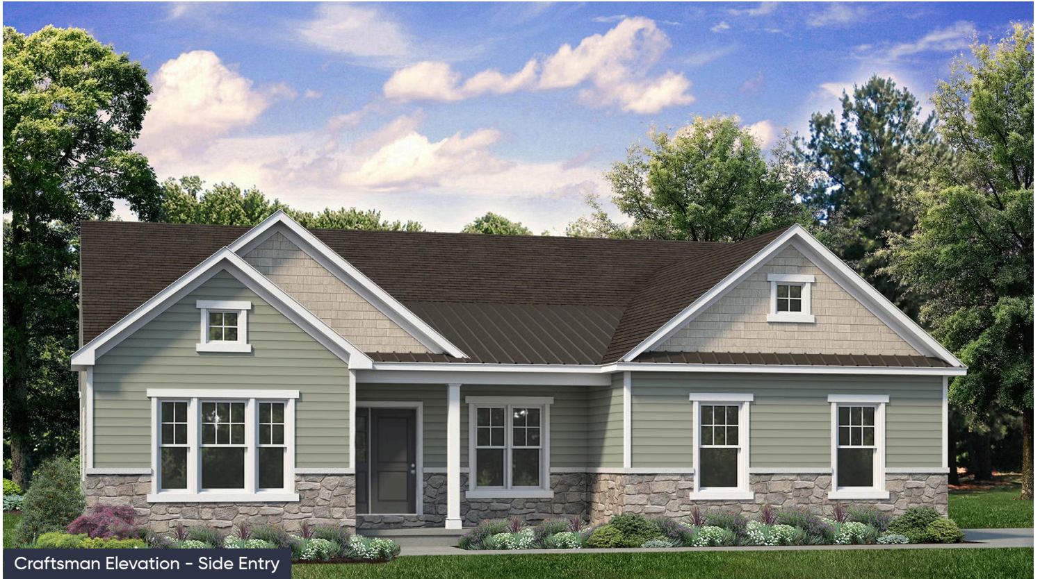
Craftsman Elevation - Side Entry

The Folino is an elegant ranch-style home with a well-planned design and alluring exterior. Step into the welcoming Foyer and continue to a private Study, two Bedrooms, and shared Hall Bath that set the tone for this sophisticated abode. The heart of this home is the open-concept Great Room, Kitchen, and Dining Room that making entertaining an effortless experience. The Kitchen boasts a large island with an overhang, offering ample seating for guests, a convenient corner pantry, and plenty of countertop space. The Great Room is bathed in natural light and leads to your backyard through a sliding door. Relax in style in your very own private haven as you enter the Owners' Suite, boasting a spacious walk-in closet and a luxurious ensuite Bath with a double vanity, linen closet, large shower, ... Read More at tuskeshomes.com