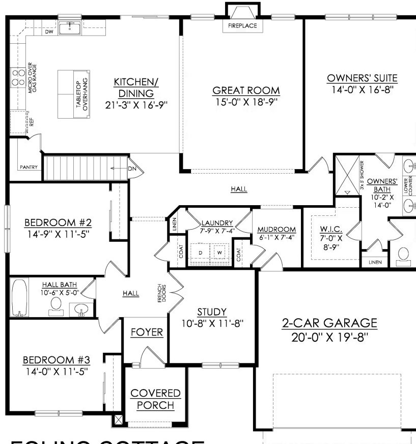
FOLINO COTTAGE STARTING AT 2134 SF

In The Estates at Steeplechase North from $694,900