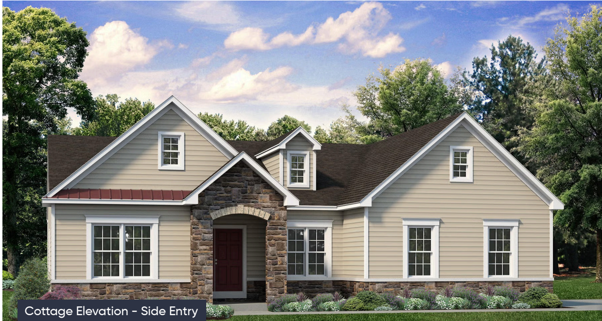
Cottage Elevation - Side Entry

In The Estates at Steeplechase North from $694,900