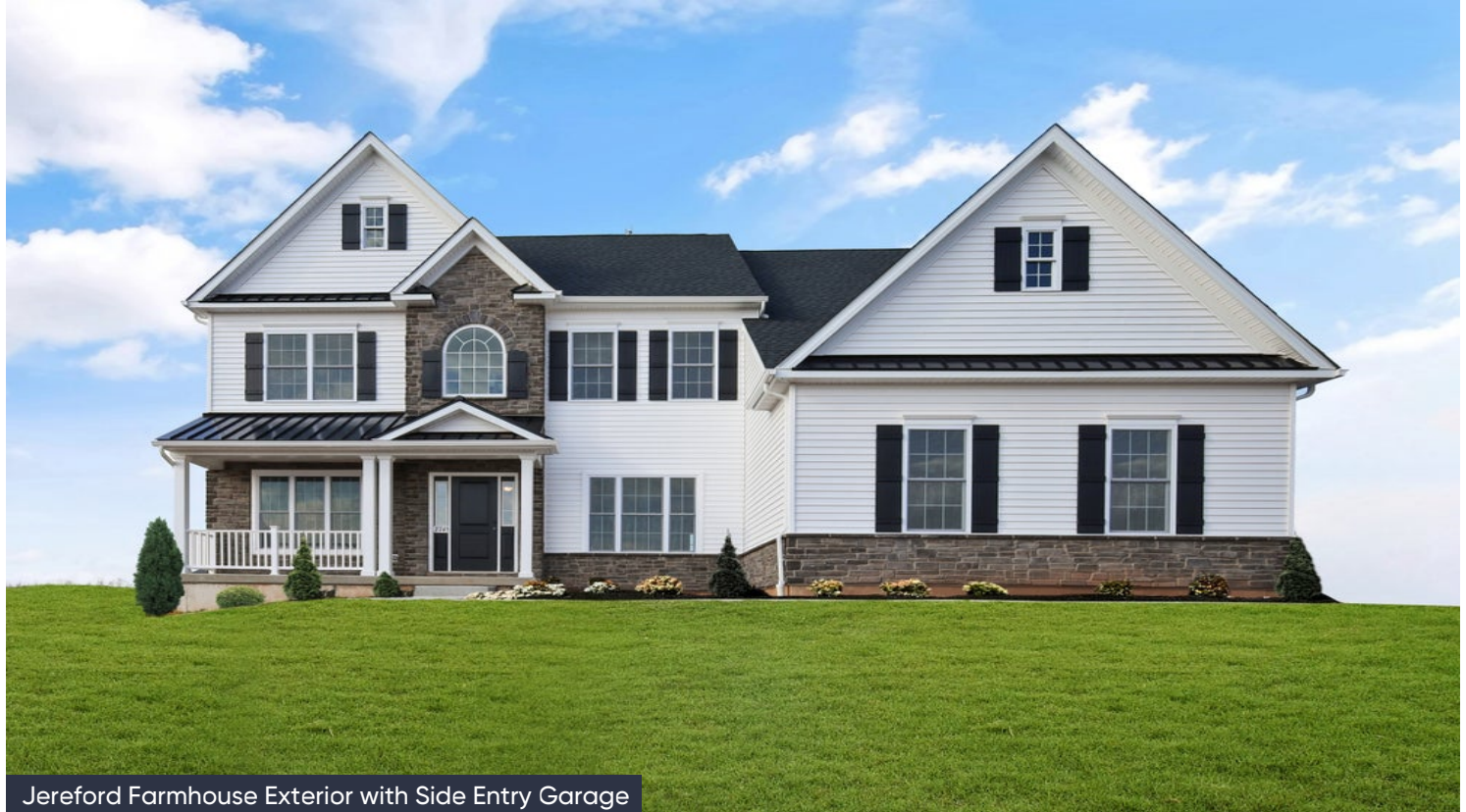
Jereford Farmhouse Exterior with Side Entry Garage

Elevate your lifestyle with the Juniper, offering the perfect balance of privacy and comfort for you and your family. An impressive two-story Foyer sets the tone for this home's spacious open-concept main living area. The Kitchen is a cook's dream, with an expanded island, a walk-in pantry, and a butler's pantry for serving drinks or snacks. The airy 2-story Great Room boasts a gas fireplace and plenty of windows for natural light. A private Study and Powder Room complete the 1st floor layout. Head up the open staircase to find an enormous Owner's Suite with sitting area, a walk-in closets, and private Owner's Bath. Additionally, a Guest Suite with its own Bath, two additional Bedrooms that share a Jack-n-Jill bath, and a convenient 2nd floor laundry room can also be found on the 2nd ... Read More at tuskeshomes.com