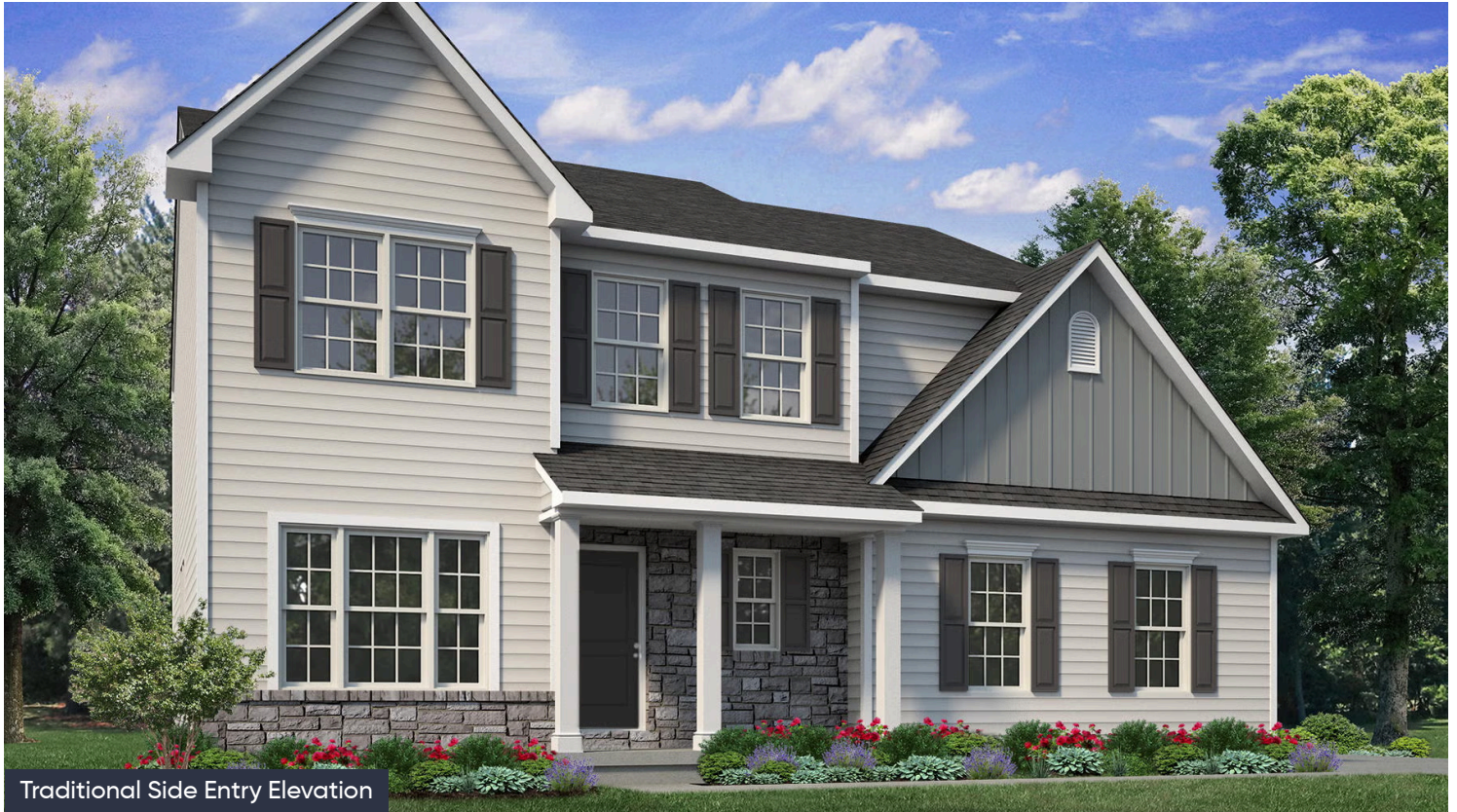
Traditional Side Entry Elevation

Welcome to the Madison, a charming and inviting home that's become one of our most popular floorplans. You'll feel right at home as soon as you step into its modern open-concept main living area. The seamless flow between the Dining Room, Kitchen with Nook, and Great Room creates a warm and welcoming atmosphere. The bright and sunny study with French doors and wall of windows is a perfect place to work or learn from home. The welcoming Foyer, convenient Powder Room, and practical Mudroom near the 2-car garage are just some of the lovely touches that make the Madison special. Upstairs, the Owners' Suite features a spacious Walk-In Closet and private ensuite Bath. And with three additional Bedrooms, a full Bath, and a second-floor Laundry Room, there's plenty of space for everyone!Some image ... Read More at tuskeshomes.com