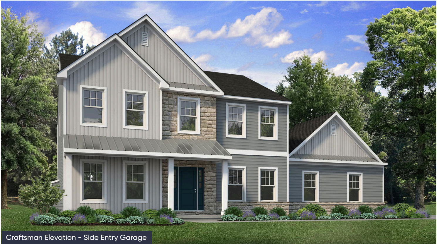
Craftsman Elevation - Side Entry Garage

Step into opulence with The Magnolia, a stunning floorplan starting at 2,820 sq ft. The Kitchen boasts a large island with seating, granite or quartz countertops, and a dining Nook surrounded by windows. The main level also includes a spacious Great Room, formal Dining Room, Private Study with French doors, Powder Room, Mudroom, and welcoming Foyer. Upstairs, the Owners' Suite features a spacious Walk-In Closet with an attached full Bath. Three additional bedrooms, a shared hall bath, and a 2nd floor Laundry Room complete the layout. For even more space, consider the optional Bonus Room above the Garage, perfect for a 5th Bedroom, Home Office, or Play Room. Some images, videos, virtual tours shown may be from a previously built Tuskes home of similar design. Actual options, colors, and ... Read More at tuskeshomes.com