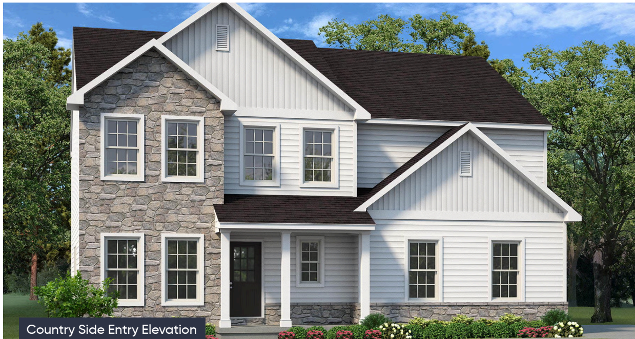
Country Side Entry Elevation

In The Estates at Steeplechase North from $694,900