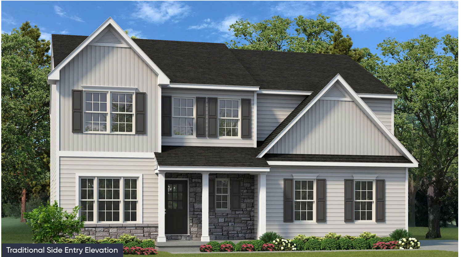
Traditional Side Entry Elevation

Designed with functionality in mind, the Morgan features a flowing, open-concept Kitchen, Dining Nook, and Great Room that are the heart of this home. As you enter through the 2 Car Garage, you'll find a Mudroom that's perfect for dropping off items like shoes, coats, or anything else you'd prefer to store. Just beyond, the expansive main living area awaits. Windows line the wall of the Great Room, and just beyond is a beautiful Kitchen that will please the pickiest of home chefs. A Foyer, Study, Dining Room/Flex Space, and Powder Room round out the first floor of this gorgeous home. Upstairs you'll find a large Owners' Suite with two Walk-in Closets and a private Bath that's perfect for getting away from it all. The remaining three Bedrooms all have their own walk-in closets and share a fu ... Read More at tuskeshomes.com