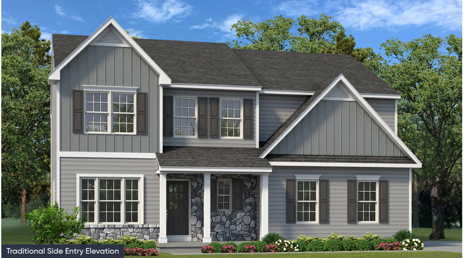
Traditional Side Entry Elevation

Designed with functionality in mind, the Morgan features a flowing, open-concept Kitchen, Dining Nook, and Great Room that are the heart of this home. As you enter through the 2 Car Garage, you'll find a Mudroom that's perfect for dropping off items like shoes, coats, or anything else you'd prefer to store. Just beyond, the expansive main living area awaits. Windows line the wall of the Great Room, and just beyond is a beautiful Kitchen that will please the pickiest of home chefs. A Foyer, Study, Dining Room/Flex Space, and Powder Room round out the first floor of this gorgeous home. Upstairs you'll find a large Owners' Suite with two Walk-in Closets and a private Bath that's perfect for getting away from it all. The remaining three Bedrooms all have their own walk-in closets and share a fu ... Read More at tuskeshomes.com