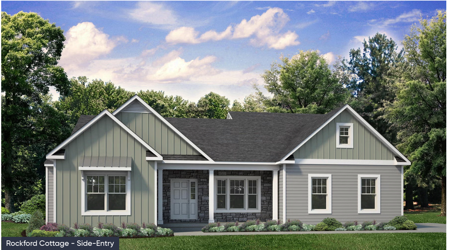
Rockford Cottage - Side-Entry

Introducing the Rockford, an inviting Ranch home designed for both comfort and style and offers a thoughtful layout that maximizes space and functionality. At the heart of the home, the open-concept design of the Great Room and Kitchen creates a welcoming atmosphere. With a grand cathedral ceiling and a wall of windows, there is a sense of openness so that no matter how many people visit, you will never feel cramped. The Owner's Suite tucked away in the back of the home includes two spacious Walk-In Closets, as well as its own ensuite bathroom for added privacy. The Rockford also features two additional Bedrooms that offer flexibility for guests, a home office, or other uses to suit your needs. With thoughtfully designed spaces and a layout that promotes flow and functionality, t ... Read More at tuskeshomes.com