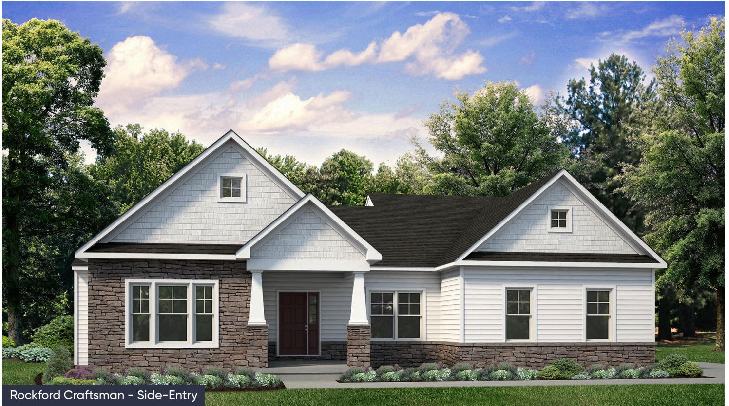
Rockford Craftsman - Side-Entry

Introducing the Rockford, an inviting Ranch home designed for both comfort and style and offers a thoughtful layout that maximizes space and functionality. At the heart of the home, the open-concept design of the Great Room and Kitchen creates a welcoming atmosphere. With a grand cathedral ceiling and a wall of windows, there is a sense of openness so that no matter how many people visit, you will never feel cramped. The Owners' Suite tucked away in the back of the home includes two spacious Walk-In Closets, as well as its own ensuite bathroom for added privacy. The Rockford also features two additional Bedrooms that offer flexibility for guests, a home office, or other uses to suit your needs. With thoughtfully designed spaces and a layout that promotes flow and functionality, t ... Read More at tuskeshomes.com