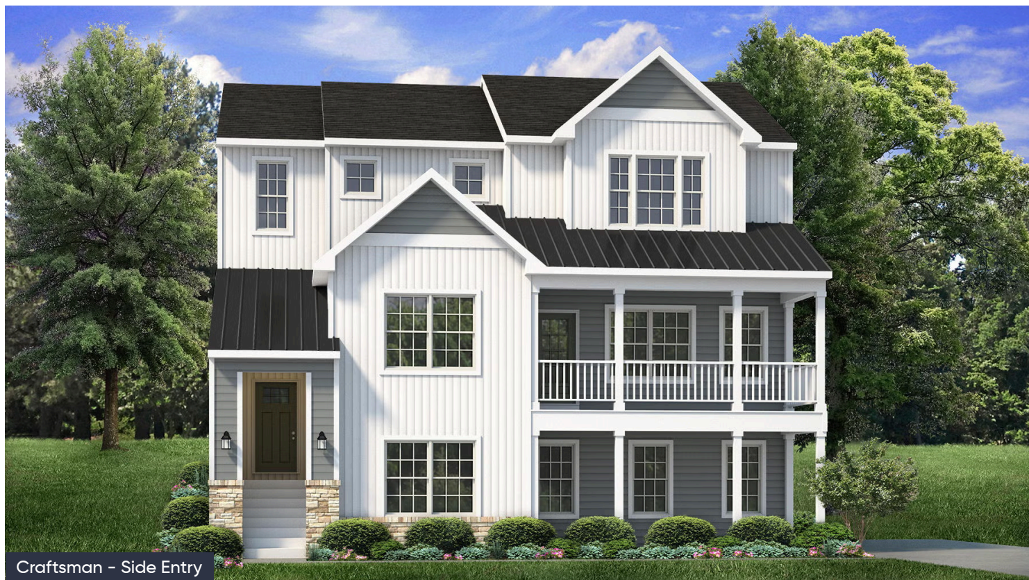
Craftsman - Side Entry

Step into luxury with The Whitehall, an impressively designed home featuring a stylish and unique floorplan. As you enter the 1st Floor through the convenient 2-Car Garage, you'll be greeted by the Family Foyer, a perfect place to keep your coats, shoes, and any other items out of sight. Take the stairs to the 2nd Floor and be awed by the spacious Entry, Guest Foyer, and Great Room with stunning views of the covered front porch. The Great Room seamlessly flows into the chic Kitchen, equipped with stainless steel appliances, granite or quartz countertops, a corner pantry, and a large kitchen island with an undermount sink and an overhang for seating. Entertain in style with a grand Dining Room or work from home in the private Study. A conveniently located Powder Room can also be found in the ... Read More at tuskeshomes.com