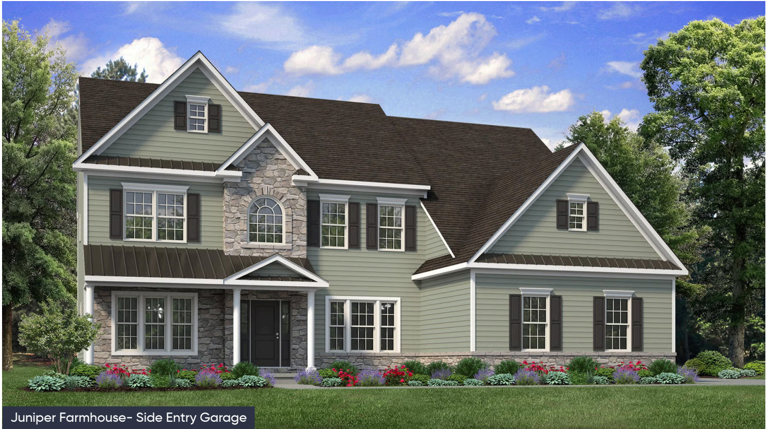
Juniper Farmhouse- Side Entry Garage

Elevate your lifestyle with the Juniper, offering the perfect balance of privacy and comfort for you and your family. An impressive two-story Foyer sets the tone for this home's spacious open-concept main living area. The Kitchen is a cook's dream, with an expanded island, a walk-in pantry, and a butler's pantry for serving drinks or snacks. The airy 2-story Great Room boasts a gas fireplace and plenty of windows for natural light. A private Study and Powder Room complete the 1st floor layout. Head up the open staircase to find an enormous Owners' Suite with a sitting area, a walk-in closet, and a private Bath. Additionally, a Guest Suite with its own Bath, two additional Bedrooms that share a Jack-n-Jill bath, and a convenient laundry room can also be found on the 2nd floor. Som ... Read More at tuskeshomes.com