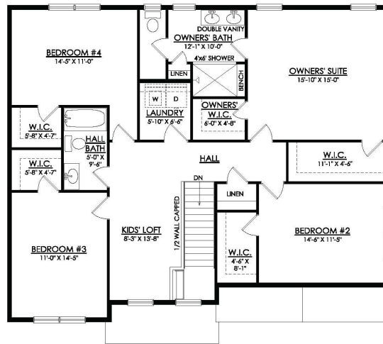
MORGAN TRADITIONAL 2ND FLOOR PLAN