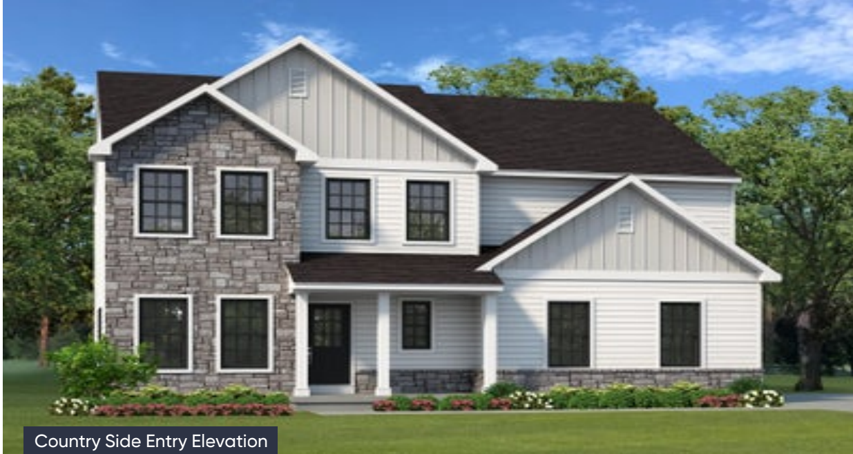
Country Side Entry Elevation