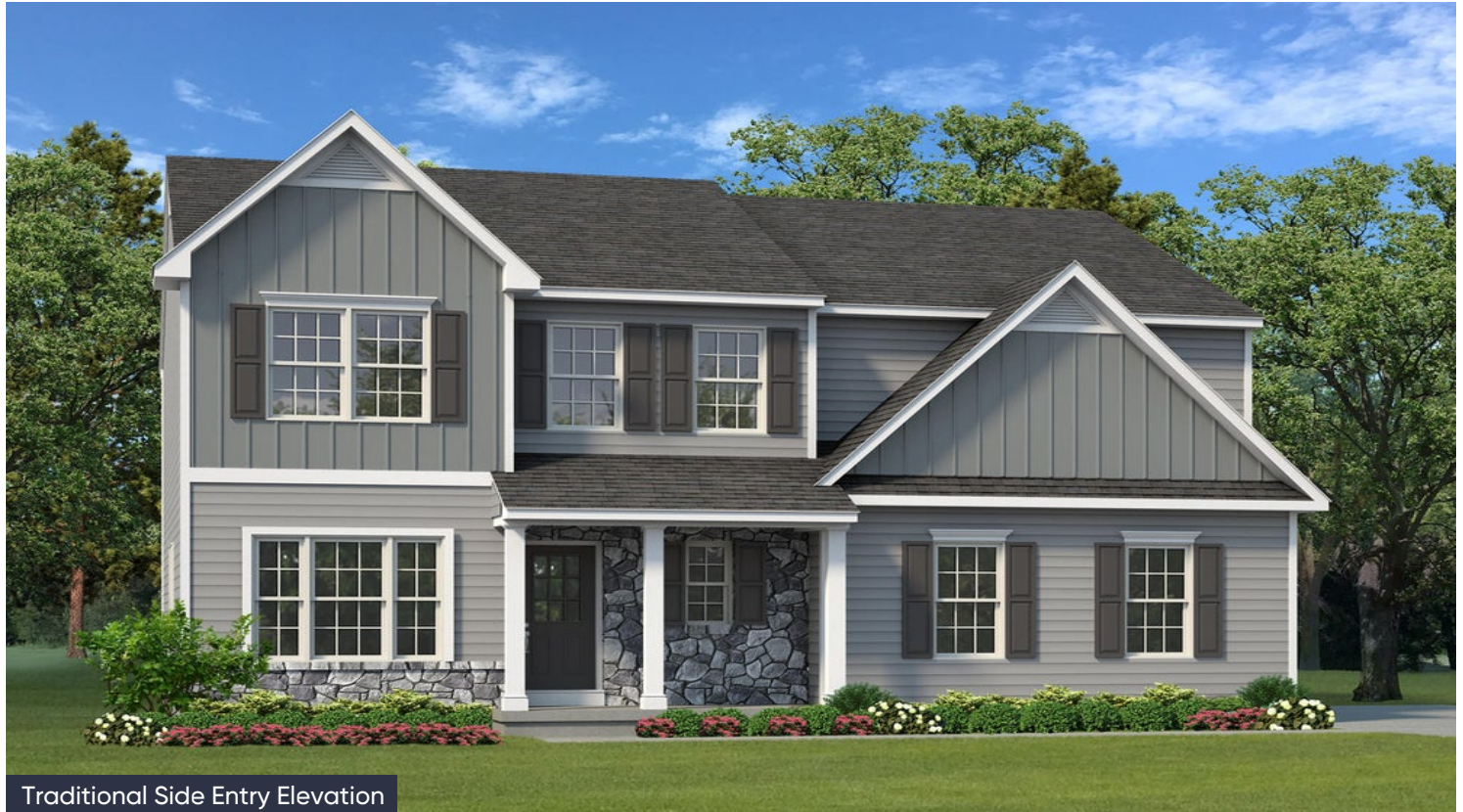
Traditional Side Entry Elevation

Designed with functionality in mind, the Morgan features a flowing, open-concept Kitchen, Dining Nook, and Great Room that are the heart of this home. As you enter through the 2 Car Garage, you'll find a Mudroom that's perfect for dropping off items like shoes, coats, or anything else you'd prefer to store. Just beyond, the expansive main living area awaits. Windows line the wall of the Great Room, and just beyond is a beautiful Kitchen that will please the pickiest of home chefs. A guest Foyer, Study, Dining Room/Flex Space, and Powder Room round out the first floor of this gorgeous home. Upstairs you'll find a large Owner's Suite with two walk-in closets and a private Owner's Bath that's perfect for getting away from it all. The remaining three Bedrooms all have their own walk-in closets ... Read More at tuskeshomes.com