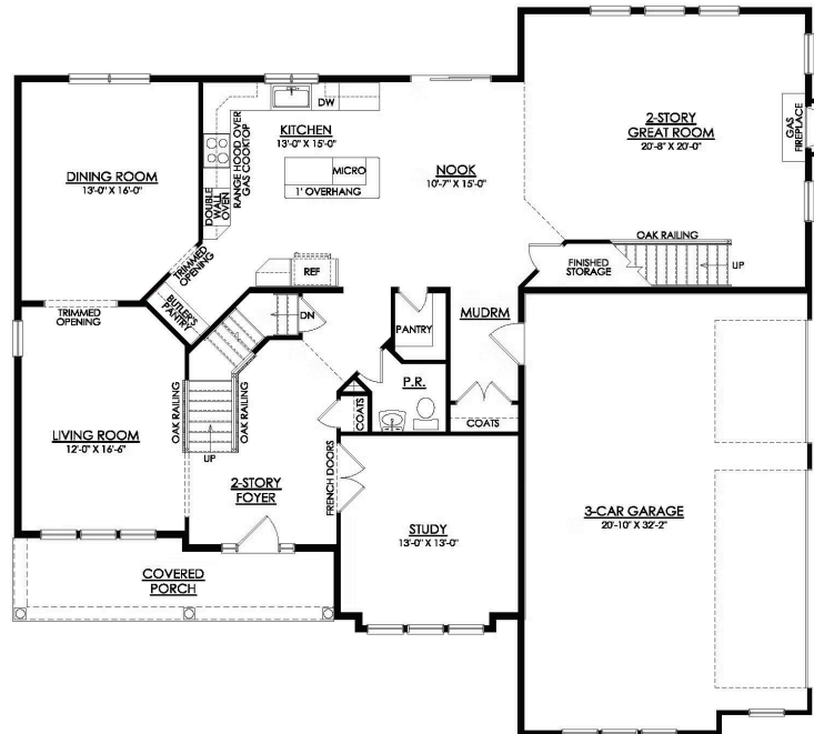
PREAKNESS FARMHOUSE 1ST FLOOR PLAN