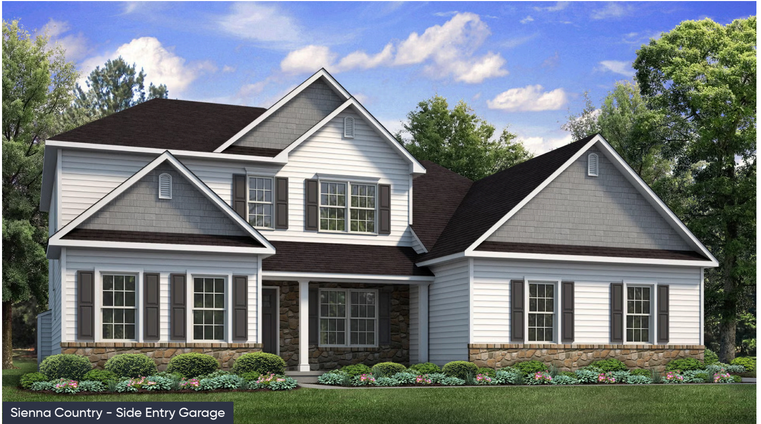
Sienna Country - Side Entry Garage

Live in luxury and style with the spacious Sienna, featuring an open-concept space that's designed for entertaining. The Kitchen boasts generous countertop space and a spacious island. Dine in elegance in the formal Dining Room or cozy Nook. The 2-Story Great Room features a relaxing fireplace, making it the perfect spot to unwind or host family and friends. The private Study, separated by double doors, provides a quiet place to work or learn from home when needed. Step into the first-floor Owners' Suite, complete with a sitting area and a private bath retreat. On the second floor, there are three additional bedrooms and a shared hall bath for the family. For added flexibility, this plan also features an optional 1st-floor In-Law Suite, which relocates the Owners' suite upstairs. Some images ... Read More at tuskeshomes.com