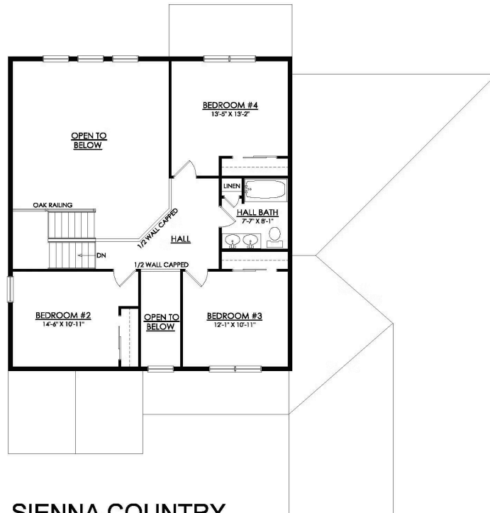
SIENNA COUNTRY 2ND FLOOR PLAN