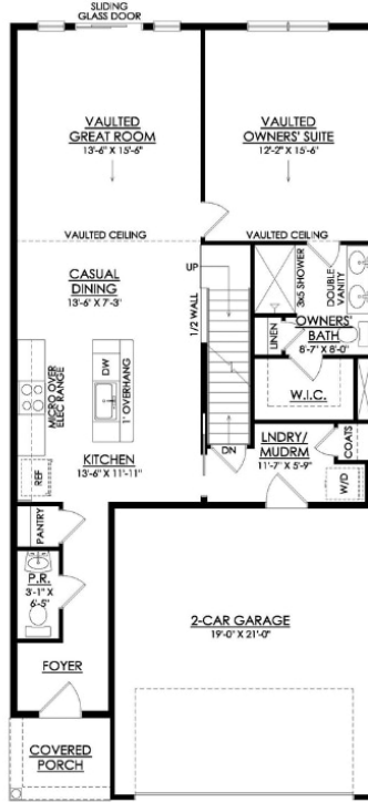
GRIFFIN- 1ST FLOOR STARTING AT 1906 SF