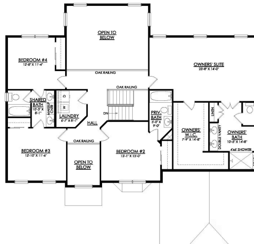
JUNIPER TRADITIONAL 2ND FLOOR PLAN