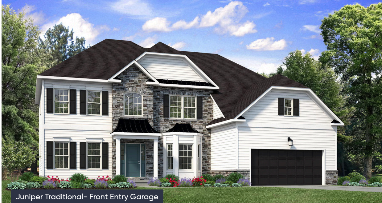
Juniper Traditional- Front Entry Garage