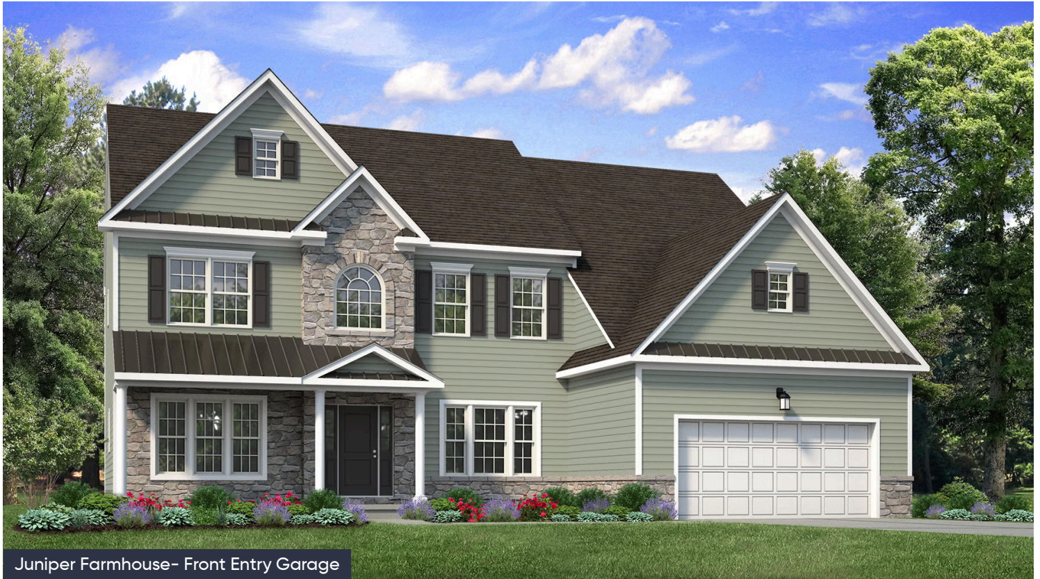
Juniper Farmhouse- Front Entry Garage

4 Beds 3.5 Baths 3,307 Sq Ft 2 Story 2 Car Garage