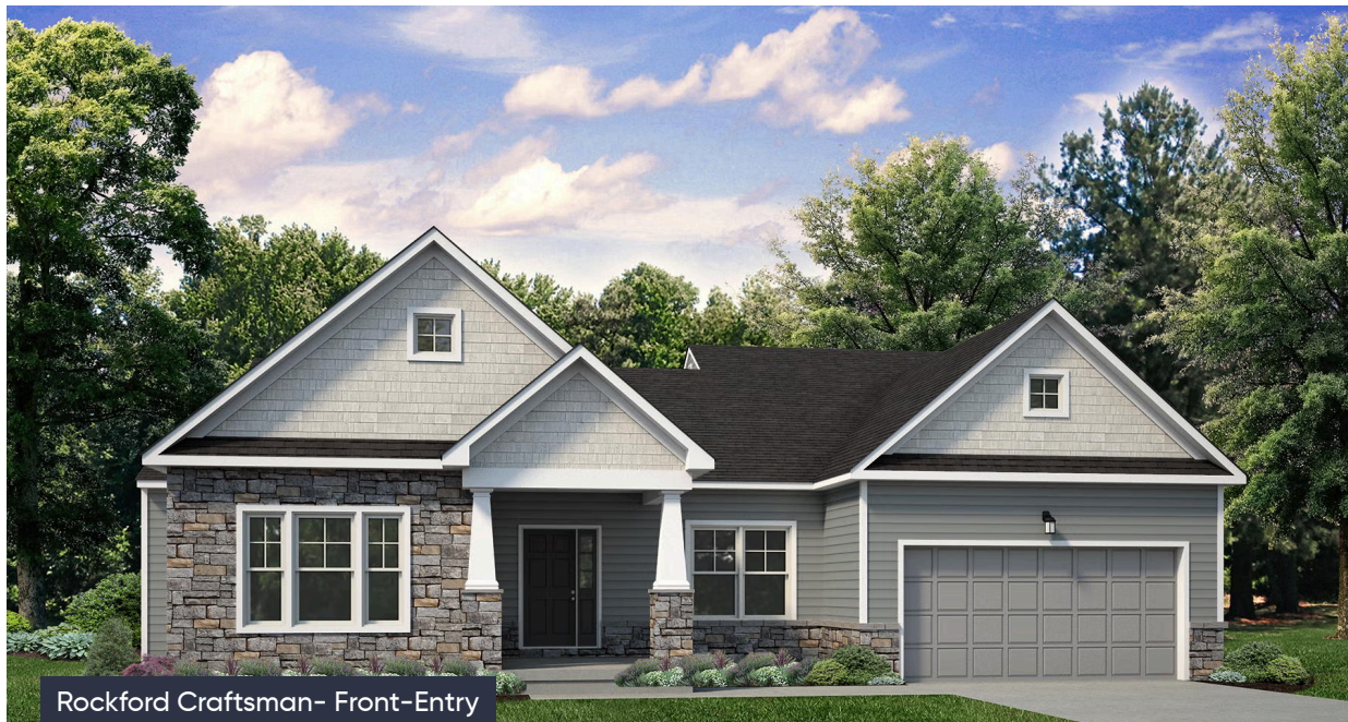
Rockford Craftsman- Front-Entry