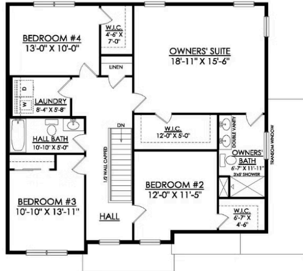
MADISON TRADITIONAL STARTING AT 2392 SF

In Hillcrest Estates at Mountain Top from $451,900