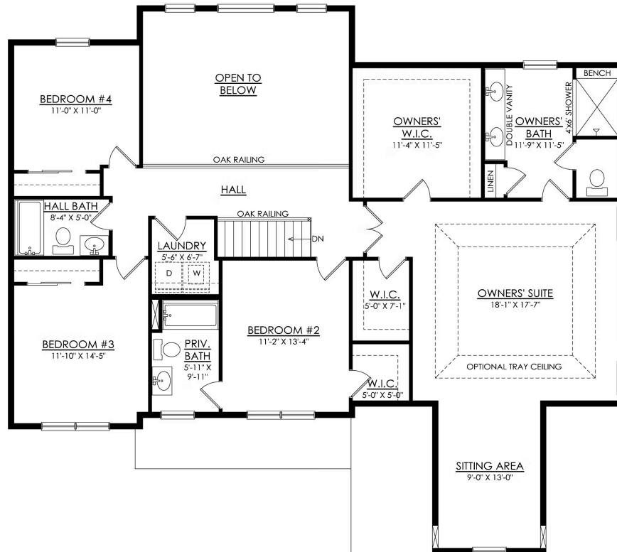
BRECKENRIDGE GRANDE FARMHOUSE 2ND FLOOR PLAN ESTATE