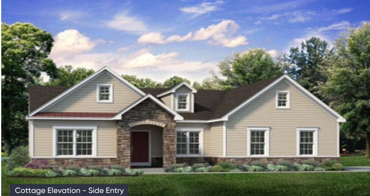
Cottage Elevation - Side Entry