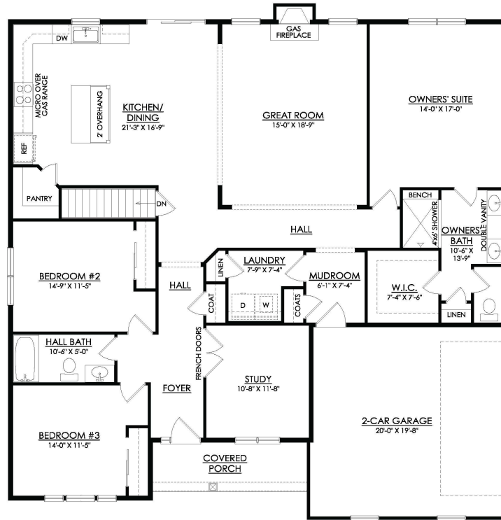
FOLINO CRAFTSMAN OVERLOOK ESTATES STARTING AT 2134 SF