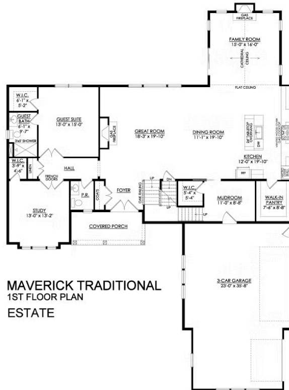
MAVERICK TRADITIONAL 1ST FLOOR PLAN ESTATE