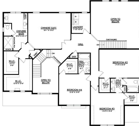
PREAKNESS FARMHOUSE OVERLOOK ESTATES STARTING AT 3763 SF