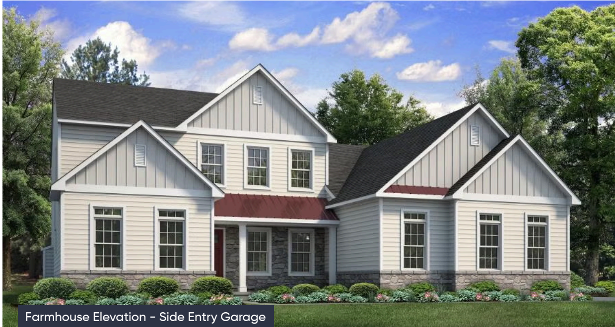
Farmhouse Elevation - Side Entry Garage