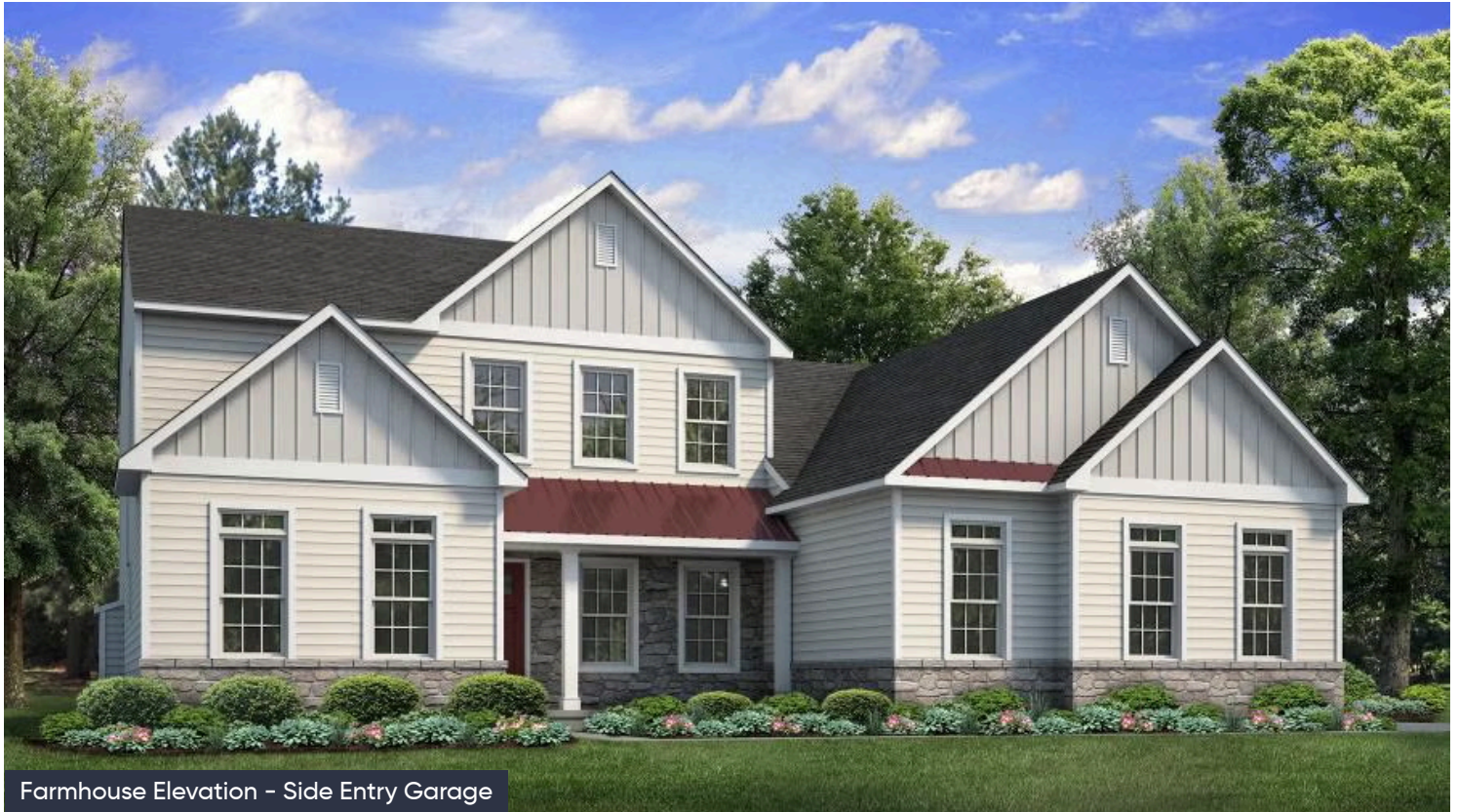
Farmhouse Elevation - Side Entry Garage

4 Beds 2.5 Baths 2,828 Sq Ft 2 Story 2 Car Garage