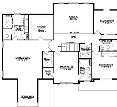
BRECKENRIDGE GRANDE TRADITIONAL MAPLE STREET AT GREENLEAF FIELDS LOT 02 3141 SF