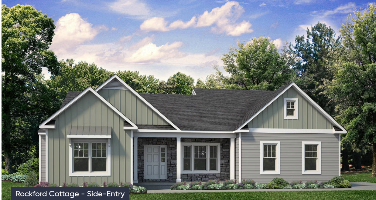
Rockford Cottage - Side-Entry

In Greenleaf Fields at Parkland from $739,900