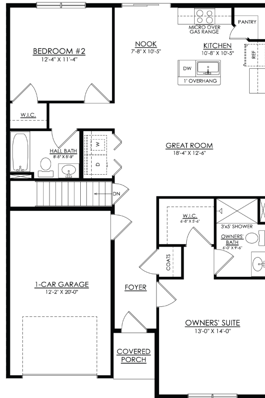
GOLDEN OAKS COTTAGES MAPLE ELEVATION STARTING AT 1,200 SQ FT